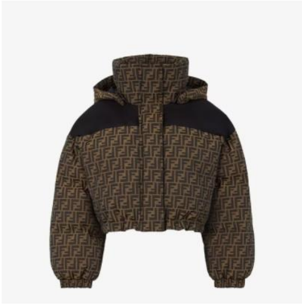
Fendi $3,100 — Brown Canvas Ski Jacket