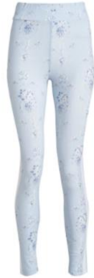
LoveShackFancy x Bogner FIRE + ICE $190 — Love Legging in Polished Blue