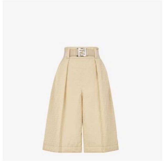
Fendi $1,450 — White Nylon Bermuda Pants