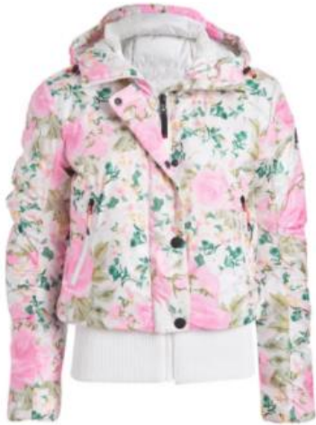
LoveShackFancy x Bogner FIRE + ICE $750 — Sella Ski Jacket in Magenta Flower Fields